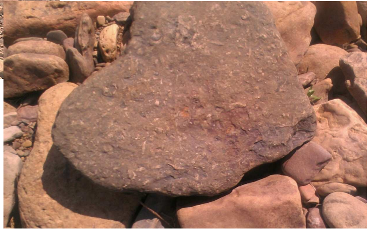
Fossil found in Arkansas