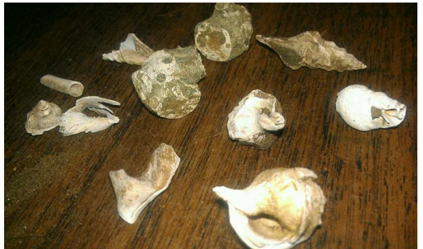
Fossils found in Nacogdoches