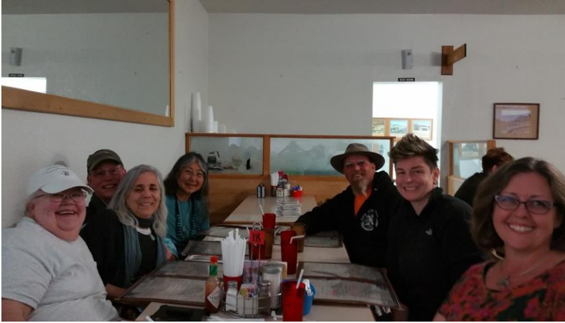
Visit with FB friends