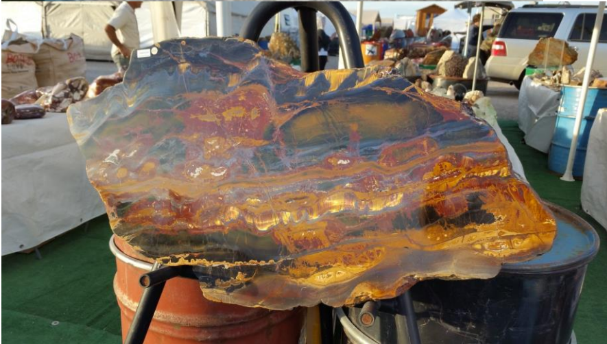
Marra Mamba from the Australian Outback tent