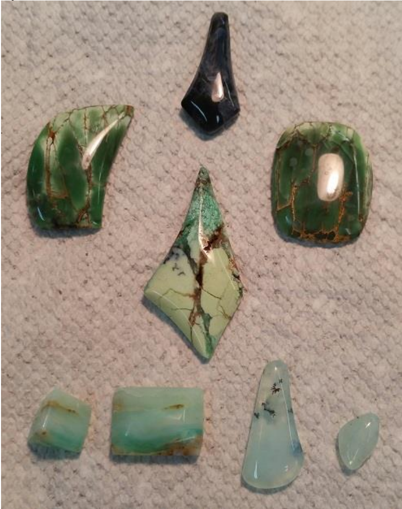
Cut from rough and polished by Lynn